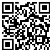
Community Needs Assessment Survey

Please scan the QR Codes below to begin!